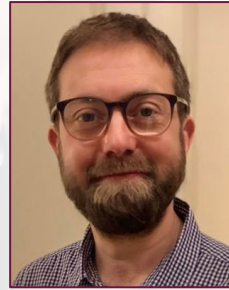
National Lead for History