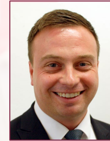
National Lead for Scholarship and Culture