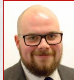
Trust VP (Cambs.)