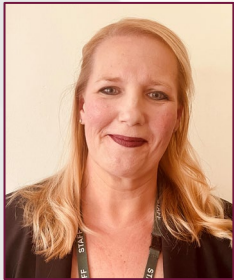
Regional Director (Cambridgeshire Secondaries)