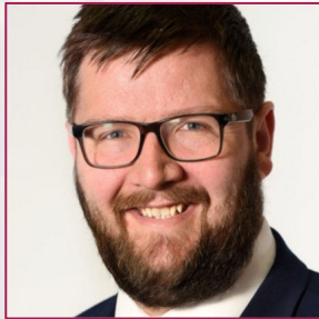
Director of Curriculum and Assessment

P1: Raising Y11 Achievement P3: Behaviour & Culture