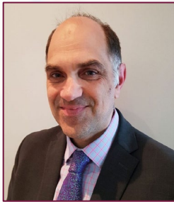
National Director of Secondary