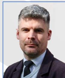
Trust VP (Cambs.)