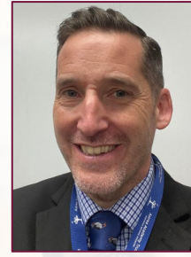
National Lead for Geography