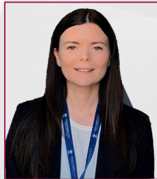
Deputy National Lead Maths