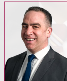
Trust VP (S. Yorks)