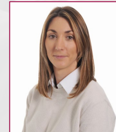
Trust AP (S. Yorks)