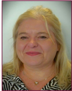
National Lead for English