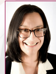
Trust A-VP (S. Yorks)