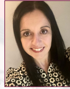
National Lead for Personal Development