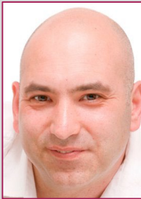
Regional Director (School Standards)

P4: Curriculum & Assessment P5: Curriculum Implementation