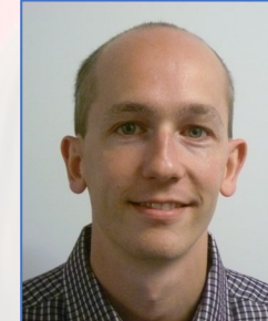
National Lead for SEND and AP