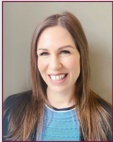
Regional Director (South Yorkshire Secondaries)