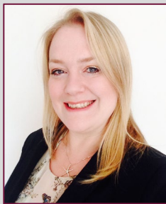
Head of SEND & Therapeutic Support