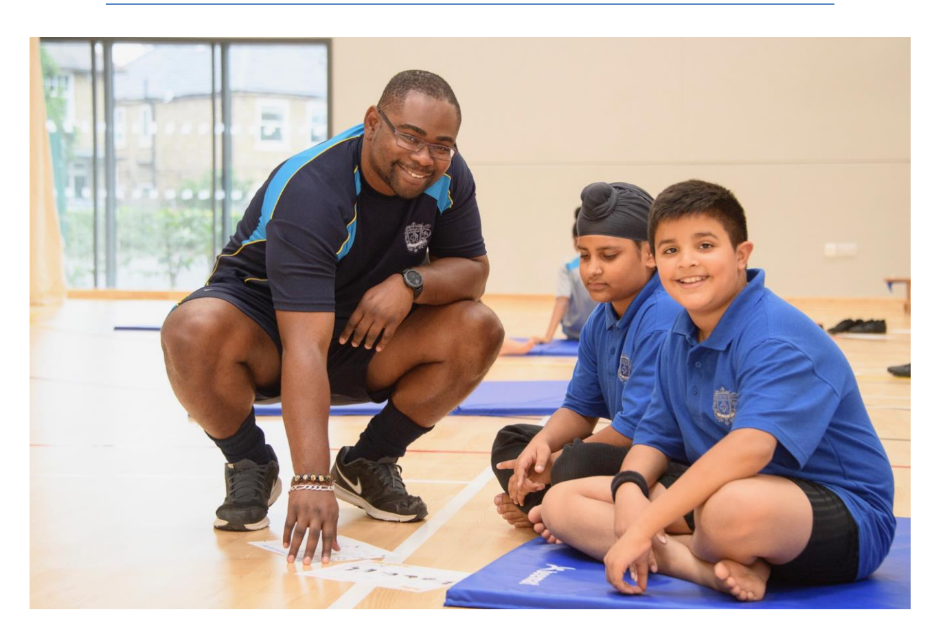
Applicants need to understand the context within which the school will operate. The following points highlight some of this context:

NSWL aims to improve educational attainment and broaden the curriculum to nurture spiritual and emotional wellbeing; promote family and faith virtues; and integrate families and community into education. The School also seeks to help to alleviate the shortage of school places and increase the diversity of education in Hounslow.