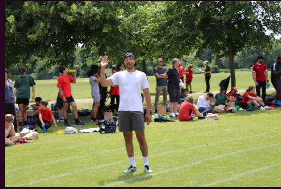
“The location by the park is wonderful”

“The small class sizes mean you are really able to make a difference to each pupil. You can really see the progress and it’s a pleasure to see their success”