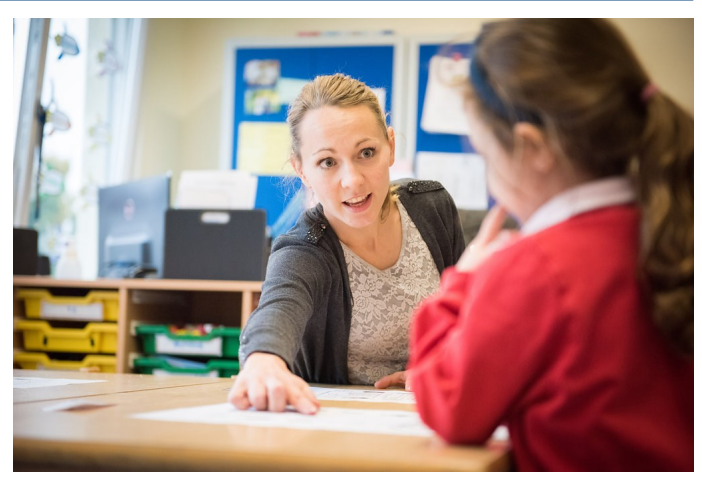
but there are some adjustments to accommodate a daily German lesson.

Pupils in the Primary School follow the Early Years Foundation Stage Framework between the ages of 2 and 4 and the National Curriculum from age 5 upwards. The curriculum incorporates the full range of subjects,