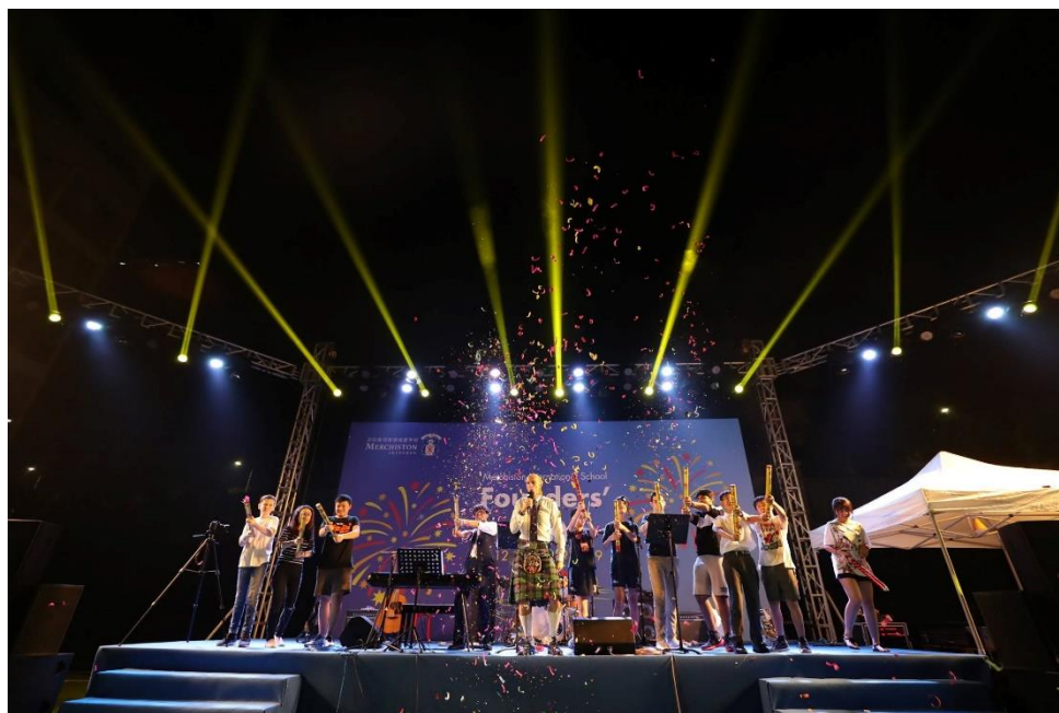
Founder's Day Celebration

https://www.youtube.com/watch?v=XVxRMbvEbGc