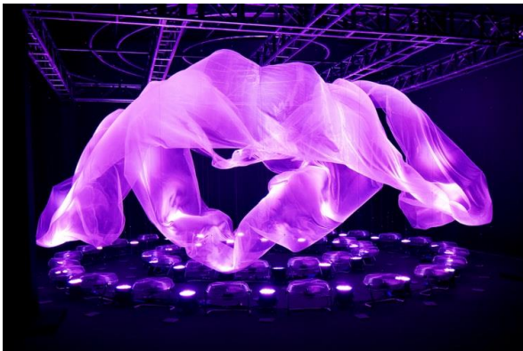
Image: Art Installation, Shenzhen

There is no doubt that life in Shenzhen is modern oriental urban , with all that that entails. The risk of air pollution compared to Europe is high – but the city is also home to public parks - unexpectedly green oases – museums and galleries. Care for the environment is now high on the agenda of the Chinese government and is being taken seriously by authorities at all levels.