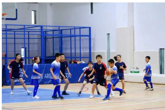
The inaugural year at MIS