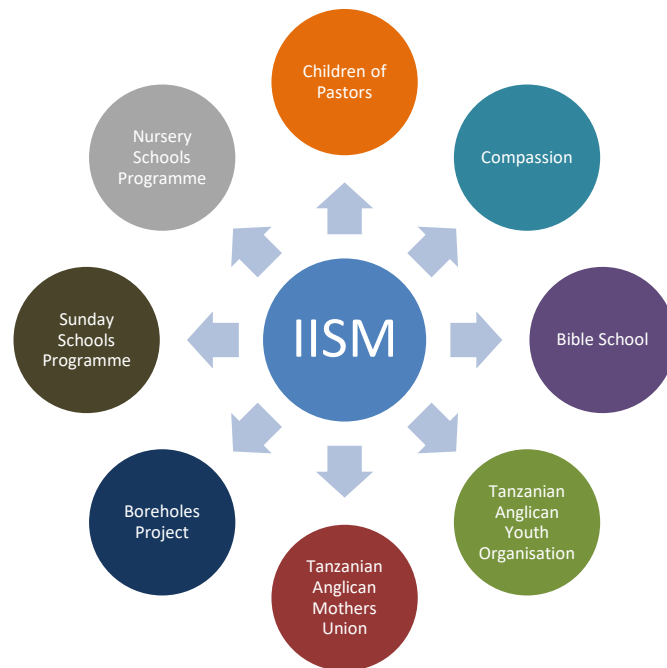
Figure 1: Organisations Supported by IISM and the Church

Sitting at the center of the local community, the city of Mwanza and the wider region, the school is integral to the voluntary sector in the region with its direct support of organisations. Not only is this through the educational development of staff and learners, it is also through the financial and strategic support provided to a range of charitable organisations.