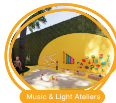
Music & Light Ateliers