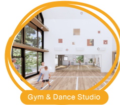
Gym & Dance Studio