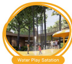
Water Play Satation