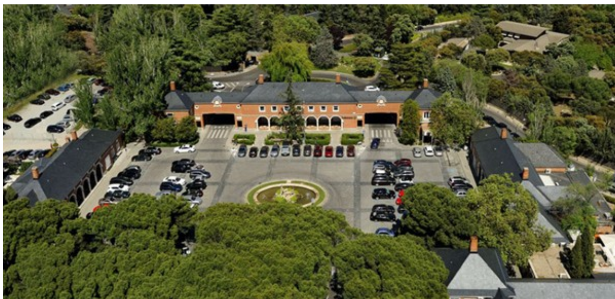
La Moraleja Plaza

The school is in La Moraleja, an exclusive residential area North of the city. It has excellent transport links, being just a 15 minute walk from the La Moraleja Metro station and a 5 minute walk from bus stops. The majority of new staff live in the centre of Madrid and travel on public transport to and from work. Some staff choose to live either in nearby Alcobendas and San Sebastian de los Reyes or in some of the mountain villages north of Madrid.