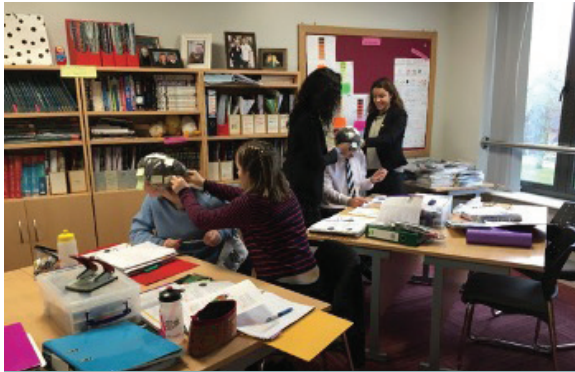
Learning about parts of the brain with shower caps

The department is well-resourced with an excellent stock of resources, both electronic and more traditional, which readily support a flipped approach to learning so that lessons can be easily devoted to the application of knowledge to questions. There is a strong sense of inquiry-based learning and the department is known for challenging students to think and take responsibility for their learning within a supportive environment. Learning is active and students are engaged with hands-on activities. Students also have opportunities to listen to a varied array of external speakers to broaden their understanding of careers relating to Psychology.