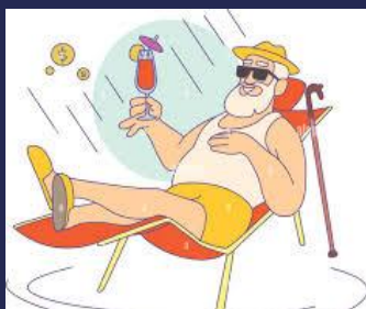
Salary exchange pension scheme