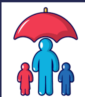
Free life insurance cover