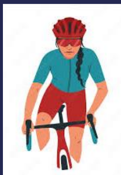
Cycle to work scheme