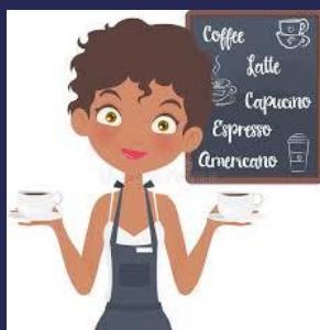
Free artisan coffee and tea