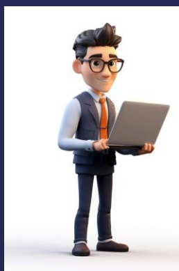
Brand new school laptop