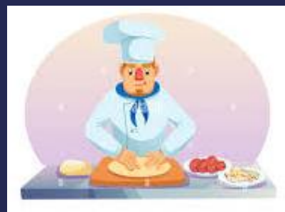
Free chef-prepared breakfast and lunch