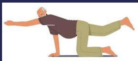
Free weekly Pilates classes