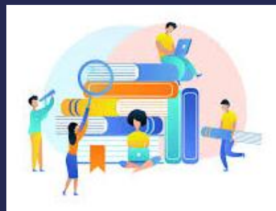
Extensive CPD opportunities