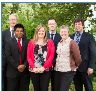
The TQEA Senior Leadership Team