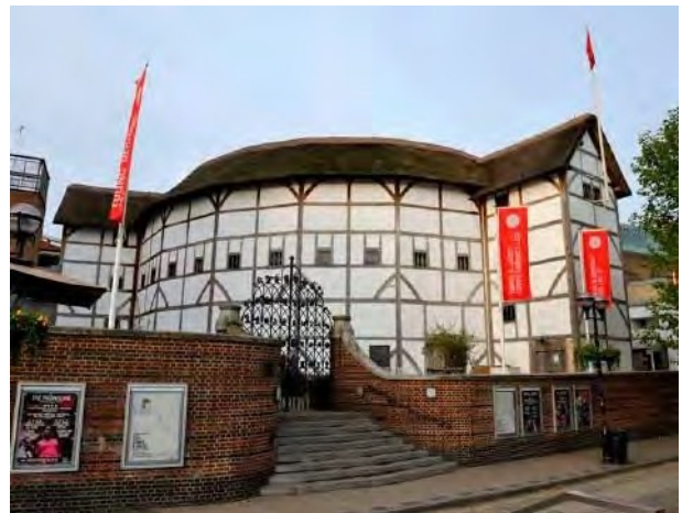
Shakespeare's Globe Theatre