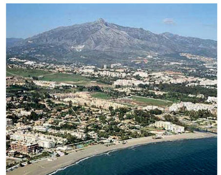
Aerial view of the beach