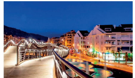
The boulevard at night