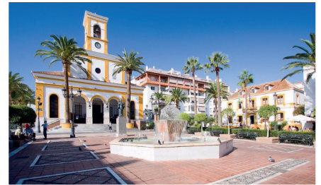
San Pedro's old town

Malaga airport is 50 minutes away, along with the historic and cultural venues within the city. There is also a fast train link at Malaga with routes throughout Spain. The school is close to Marbella and Estepona and there are many local attractions and events throughout the year.