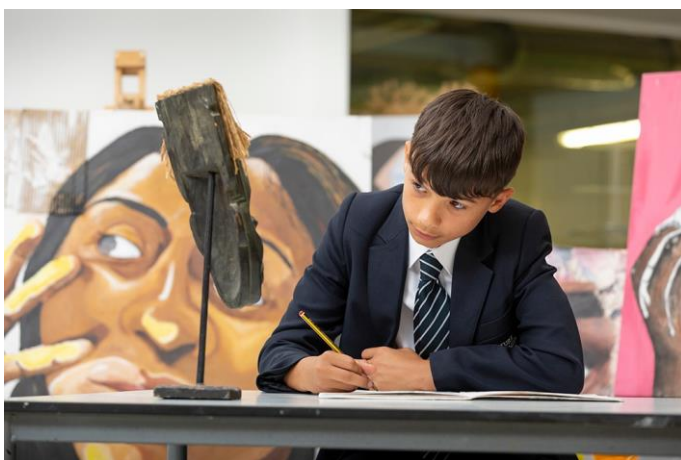
Art & Design - An amazing space creating 5 classrooms, over two open plan floors, 2 food tech rooms and outstanding design and technology suite.