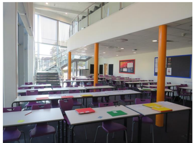
Sixth Form Centre – our spacious facility allows are Sixth Form students a dedicated learning space for them to complete their independent study throughout the day.