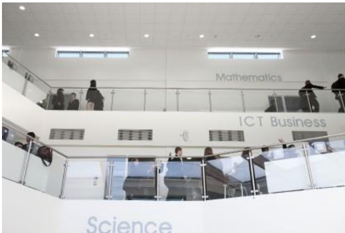
The Plaza - our fantastic Plaza offers a wealth of learning resources and laboratories including a wonderful central open plan learning space.