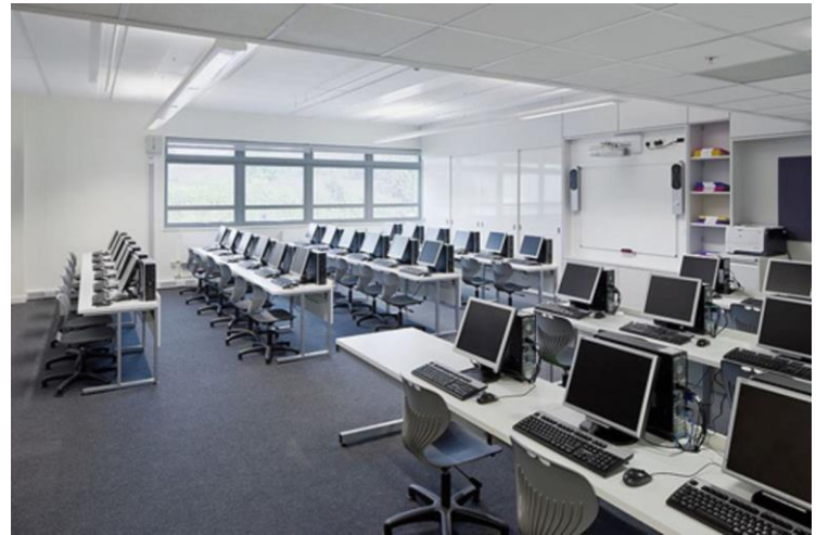
IT suites – we are fortunate to have excellent IT facilities that also includes a Mac suite.