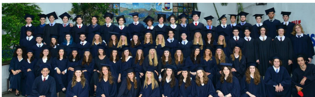
Urca Site Graduates – Class of 2015

In addition to being an IB World School, The British School has been accredited by the Council of International Schools (CIS) since 1999 and is visited by teams from CIS every 5 years in order to assess the quality of operations and programmes across all sites.