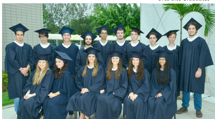
Barra Site Graduates – Class of 2015