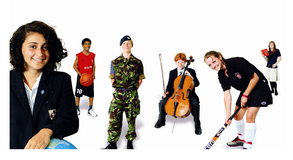
For further information, including the latest news and exam results, please visit our website www.alleyns.org.uk

Alleyn's School is an Equal Opportunities employer and welcomes applications for all posts from appropriately qualified persons regardless of age, disability, ethnicity, gender, marital status, sexual orientation, religion or belief.