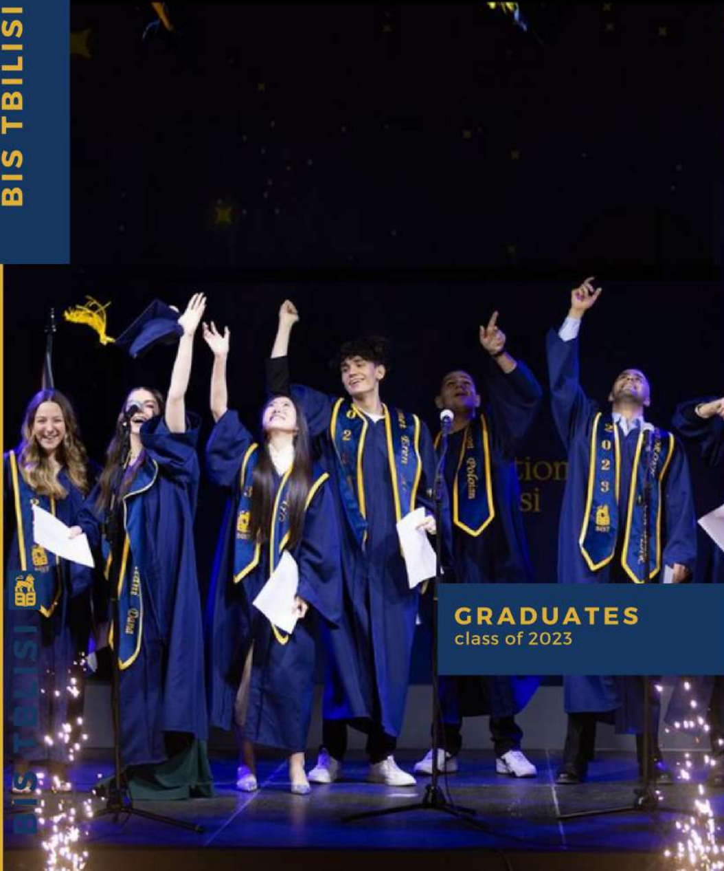
GRADUATES class of 2023