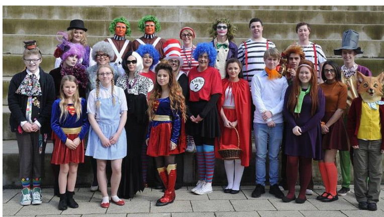
World Book Day 2016