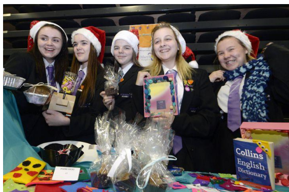
Charity Christmas Craft Fair

Furness Academy also has a strong sense of social responsibility, therefore, alongside the above events we hold a number of charity events throughout the year that our staff and students actively participate in. These include sponsored walks, funfairs, craft fairs and coffee mornings.