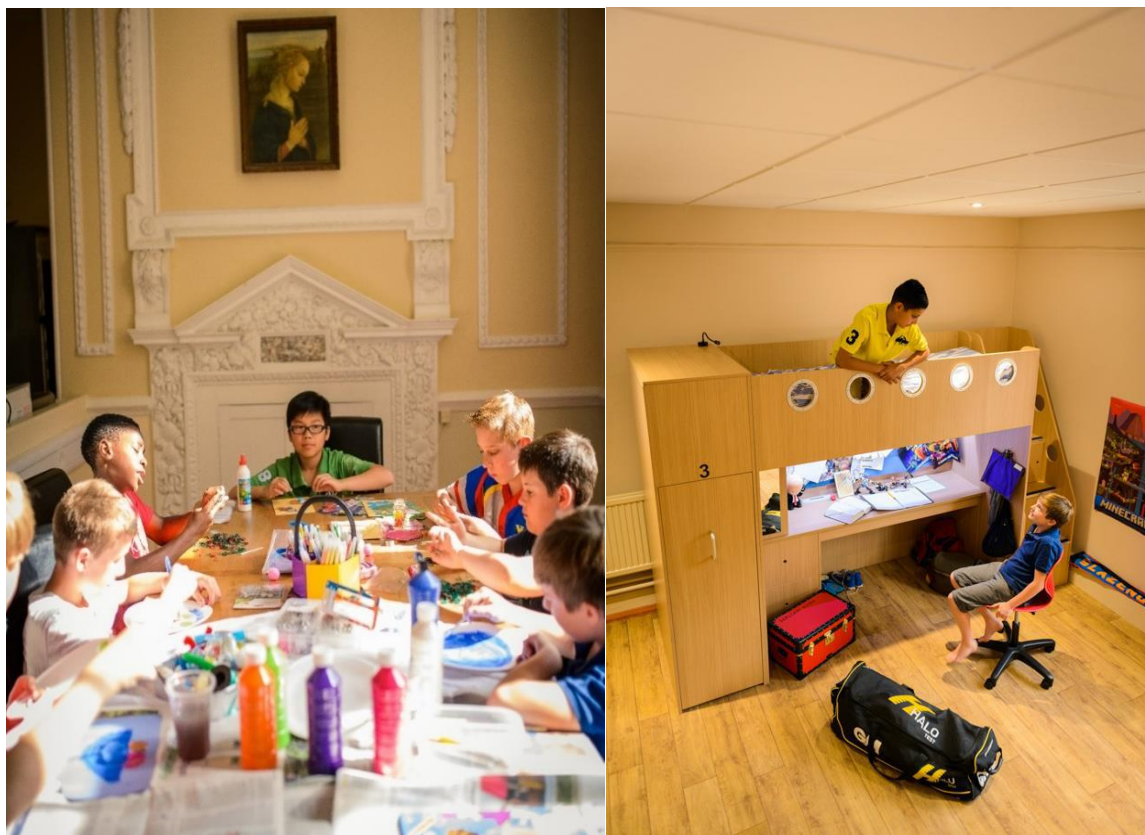
Junior boys enjoying time in Earle House

No two days are the same in boarding; every day you see students grow and flourish, making it a rewarding and exciting community.