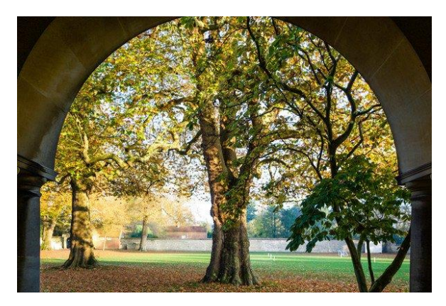
"Winchester is a place where you can make things happen"

This unparalleled combination attracts pupils from across the world, making Winchester a truly international community which celebrates every pupil's individuality, passions and potential.