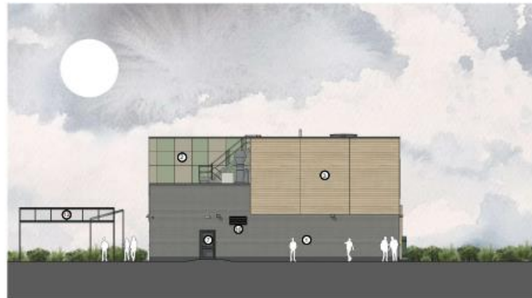
Proposed East Elevation 1 : 100