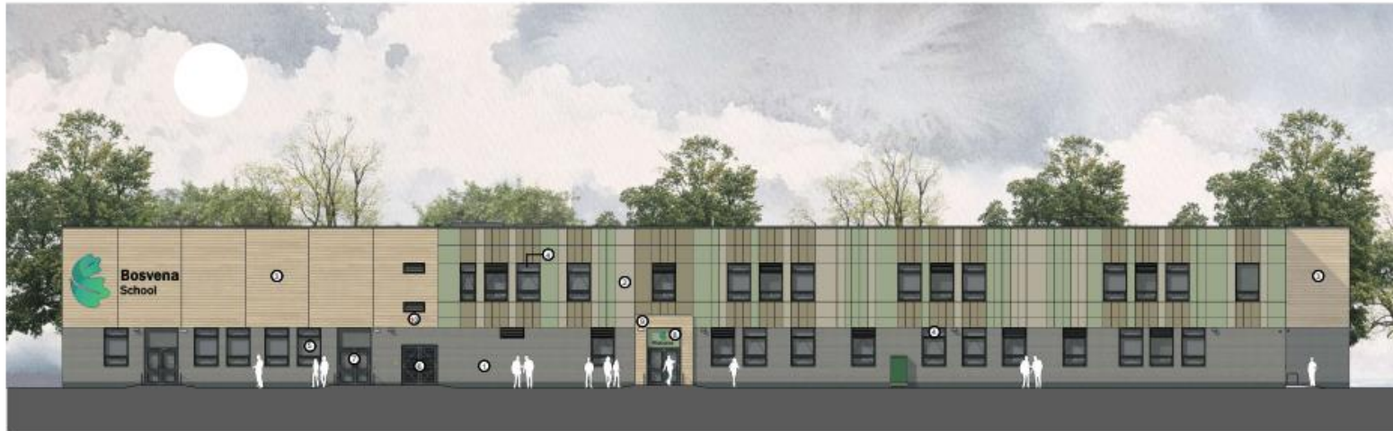
Proposed North Elevation 2 - 100