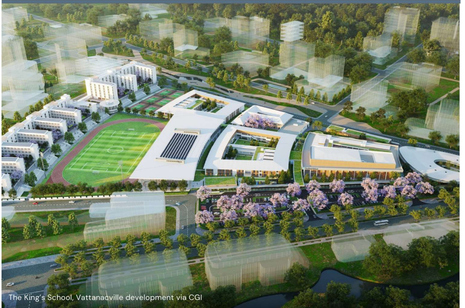
The King's School, Vattanacville development via CGI