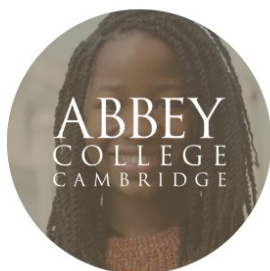
ABBEY COLLEGE CAMBRIDGE

Alpha Plus staff are dedicated to providing top quality provision for every student. All students are welcomed into the local college and we ensure that each individual has an exceptional experience.