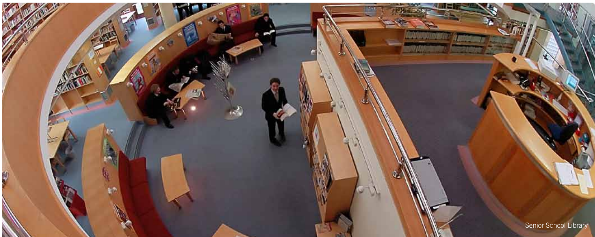
Senior School Library

The School is a hardworking environment but offers a diverse range of opportunities for pupils and staff within a strongly academic and ordered framework. We seek to appoint teachers who are passionate about their subjects and the learning experience pupils receive. We aim for them to actively inspire and engage students by putting learning within the context of intrinsically interesting academic disciplines. The School encourages pupils both to reflect on their evolving ability as learners and to demonstrate their ability to learn and understand content and concepts.