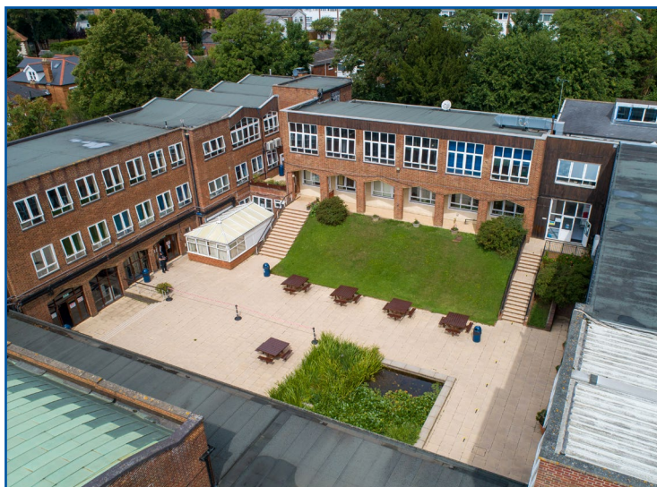
Ursuline High School, Wimbledon