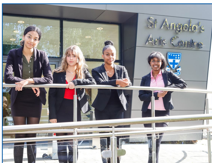
St Angela's Arts Centre at Ursuline High School, Wimbledon