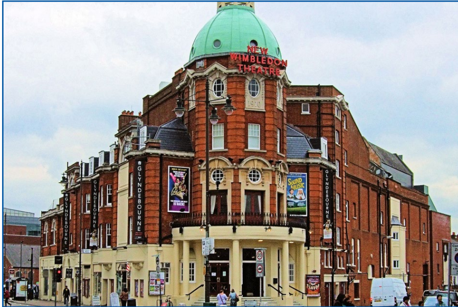
New Wimbledon Theatre, Wimbledon High Street