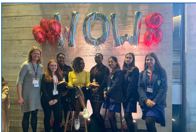
International Day of the Girl