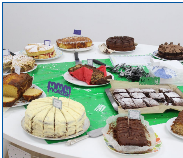
Macmillan Coffee Morning