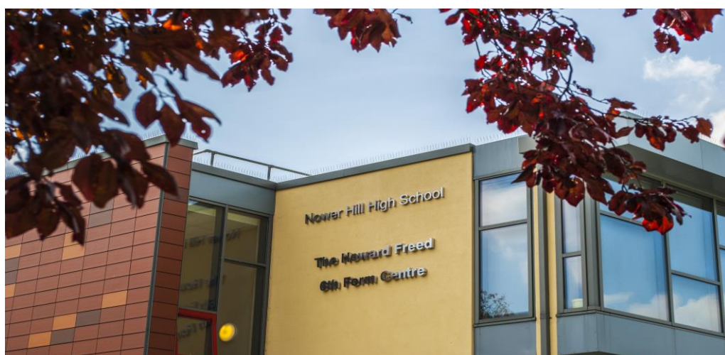
Nower Hill High School, 6 th Form building

The recent additions to our site are a superb 6 th Form Centre, a first class English teaching block (13 classrooms), an additional block of 5 state of the art Science labs (making a total of 16 Science labs) and an excellent Fitness Suite which is free for students and staff to use. The school site and buildings are well looked after with £4m being spent on new roofs, windows and toilet blocks over the last few years. There are further projects in the pipeline, including new PE changing rooms.