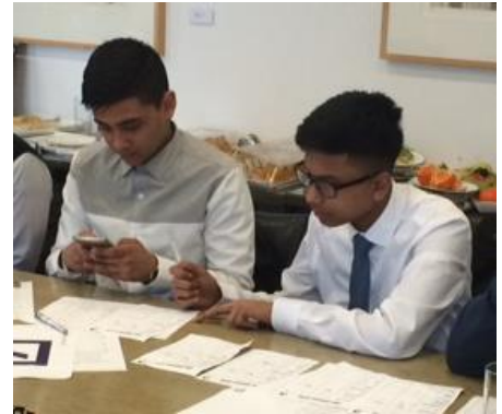
mock trading exercise, Deutsche Bank