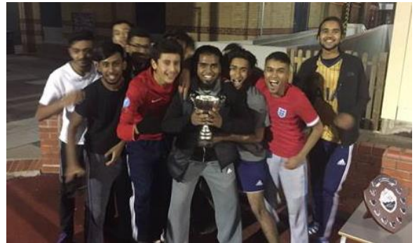
SFE football champions