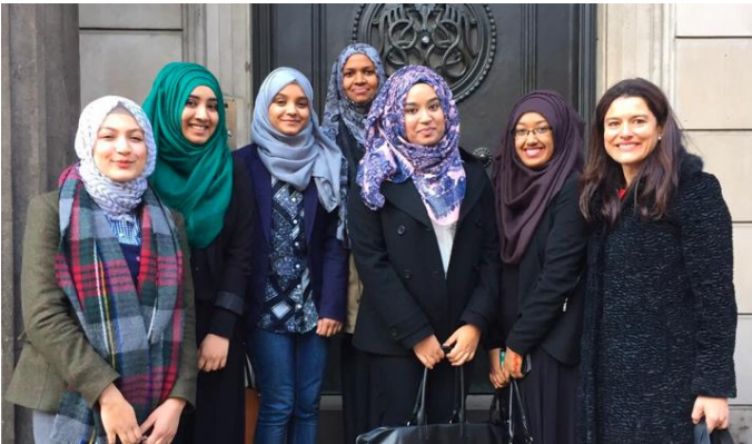
Inspiring Women in Finance' event, Bank of England