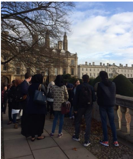
Trip to University of Cambridge