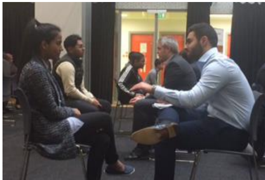
Mock interviews with Barclays volunteers