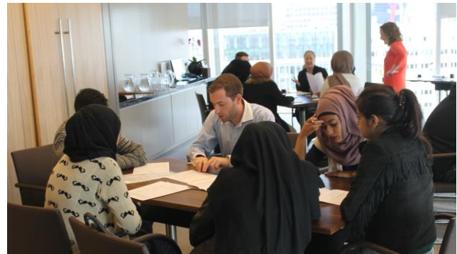
Career Capital CV workshop at Davis Polk LLP