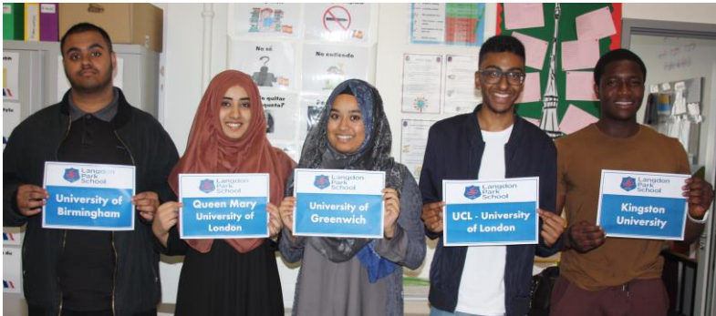
Celebrating success on results day

A team of specialist sixth form tutors provide students with individual coaching to ensure they manage their workload effectively and perform to their full potential. In addition, a number of Year 12 students receive 1-1 academic mentoring and study skills support from current QMUL undergraduates. Our designated sixth form study room offers a quiet place to study during free periods and after school. We provide academic writing support, and encourage students to extend themselves beyond their course syllabus by undertaking online courses and entering competitions such as Senior Maths Challenge.