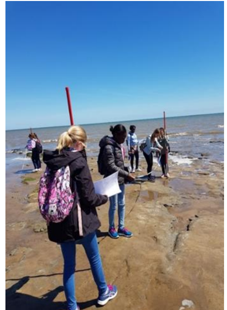
GCSE Fieldwork at Walton-on-the-Naze

The Geography Department has a good relationship with past students, and we often welcome Old Fishes back to share their experiences with current students.