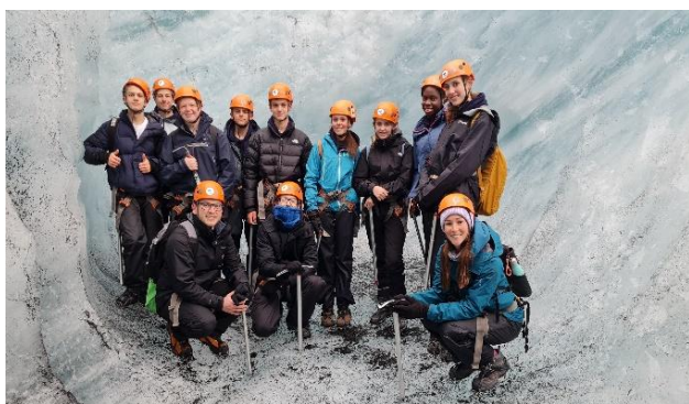
2024 Iceland Trip

We are also keen to provide more adventurous opportunities to our students through international trips. In recent years, destinations have included China, Switzerland and Iceland.