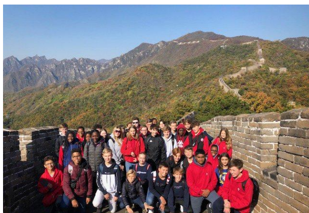
2019 China Trip

We also make good use of the local area, conducting fieldwork around the Chelmsford area with a range of year groups.