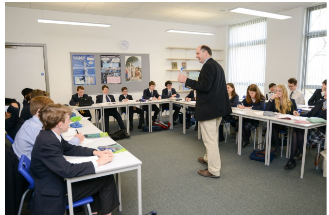
Hodgson Hall P & T classroom

Further information will be available at interview.