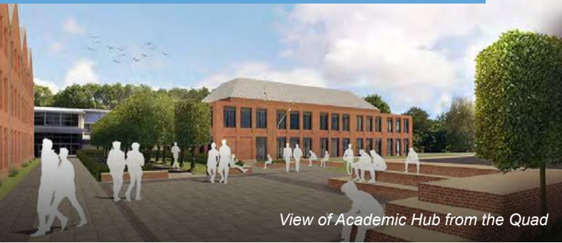
View of Academic Hub from the Quad