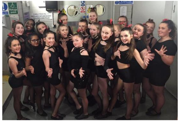
Salford Dance Explosion