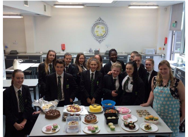
The Great Walkden Bake Off