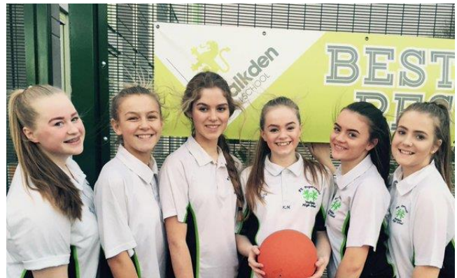
Fantastic sports' teams