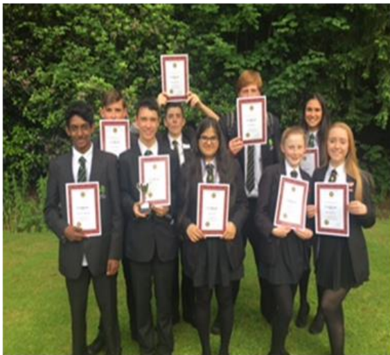
Rotary Club Young Citizens