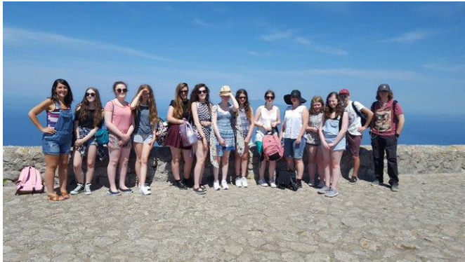
Ancient History trip