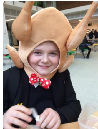
Wear A Hat To School Day