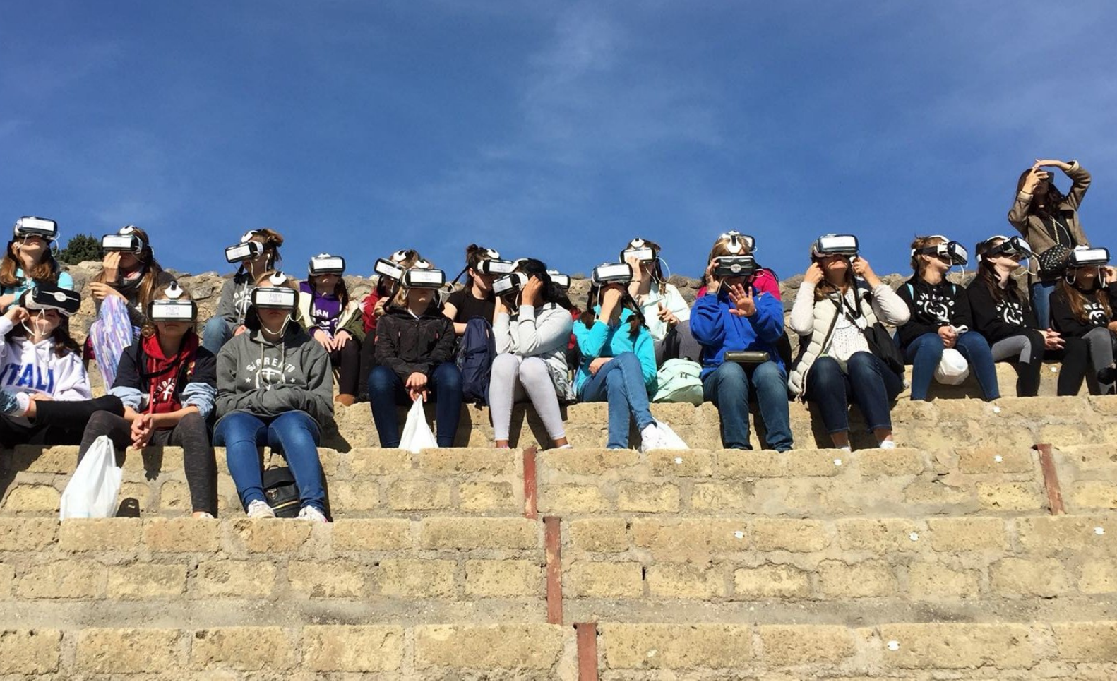
Picture: Virtual reality tour of Pompeii. Sutton High School Classics trip, November 2017.