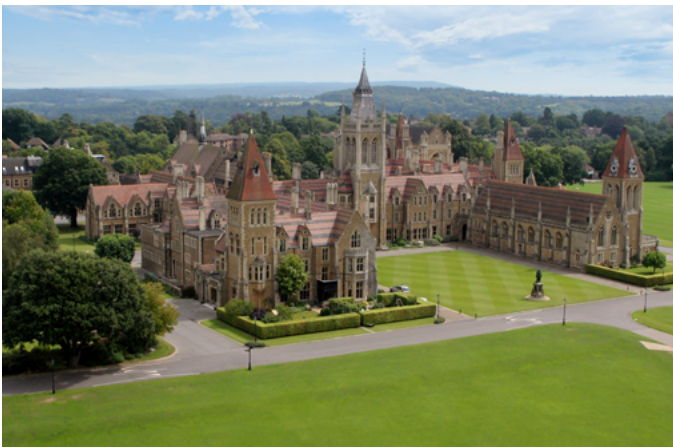
Charterhouse, UK Godalming, England

Two members of the Charterhouse leadership team sit on the Charterhouse Almaty Advisory Board. Charterhouse will carry out an annual inspection of Charterhouse Almaty to ensure we maintain the educational standards, key values and ethos of a Charterhouse education, and successful candidates will benefit from digital conferencing and 'how we do things' conversations with peers from our parent school.