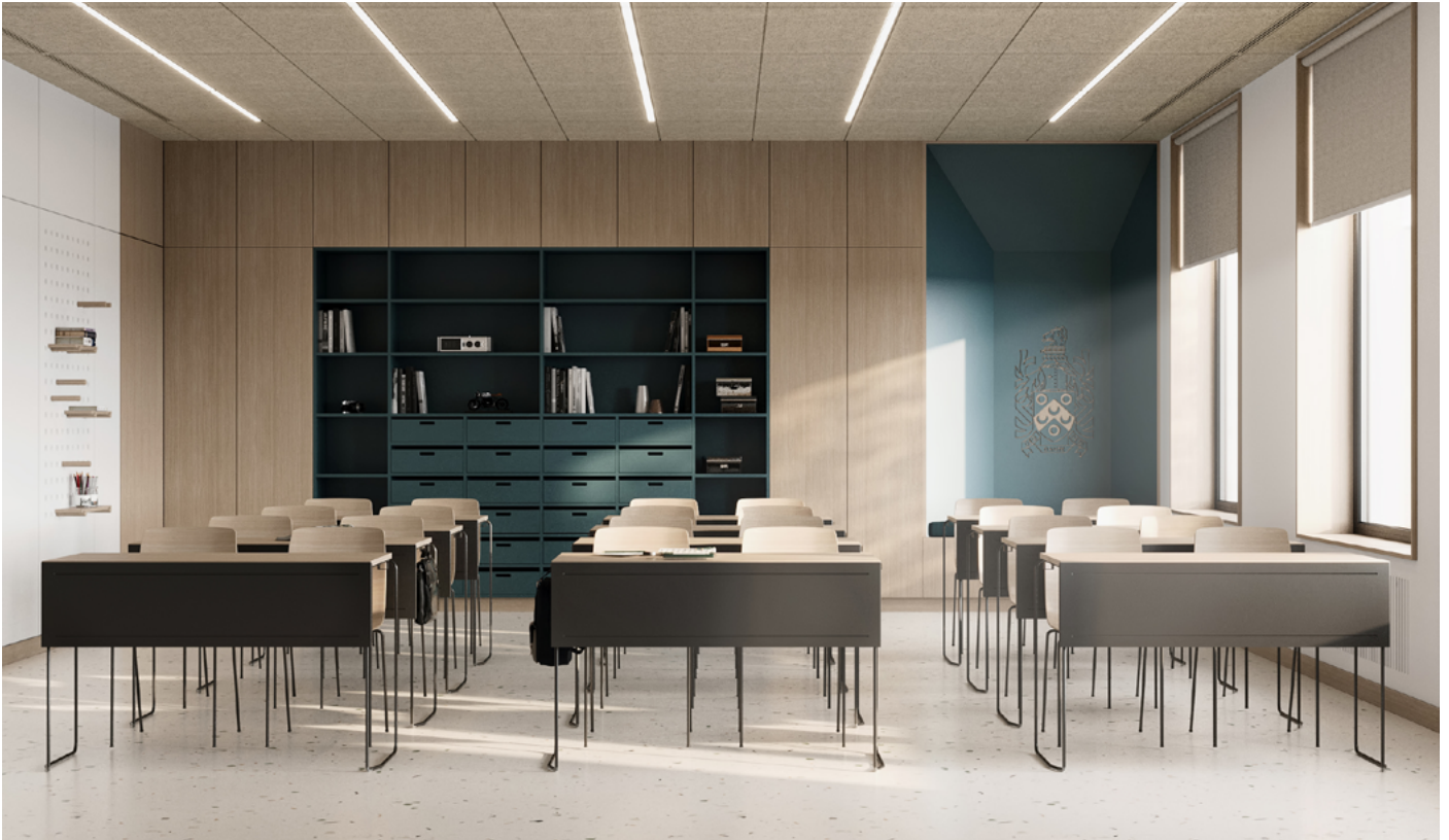
Elegant, light-filled classrooms designed for modern learning.