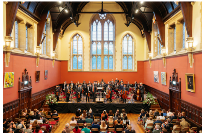
The Hall at Charterhouse, UK