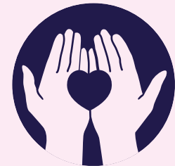
Givers, Not Takers