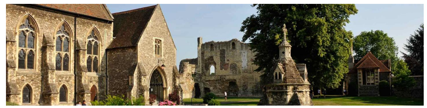
The school library, Undercroft, and ruins of St Augustine's Abbey on the St Augustine's campus at King's

The King's School occupies various sites around the Cathedral and its precincts. Many teaching departments and the majority of houses are in the beautiful ancient buildings around Green Court on the north side of the Cathedral. To the east of the Cathedral the St Augustine's site is home to five boarding houses, a medieval refectory, and the magnificent neo-Gothic school library. There are two major sites for sport: Birley's, and the Recreation Centre, both within walking distance of the school, with rowing at Westbere Lakes in Sturry. The International College opened in September 2018 as the third school in the King's family, and a fourth school opened in Shenzhen, China, in 2019.