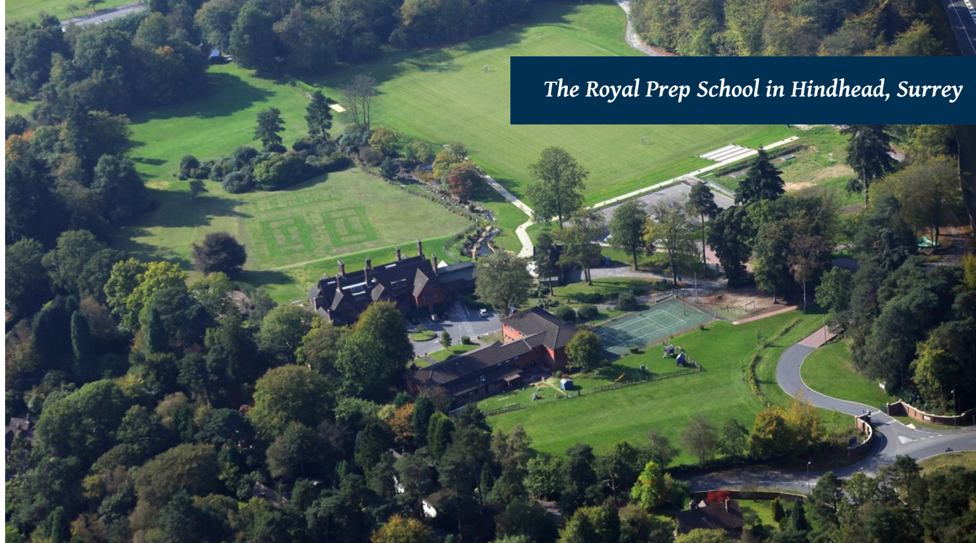
The Royal Prep School in Hindhead, Surrey