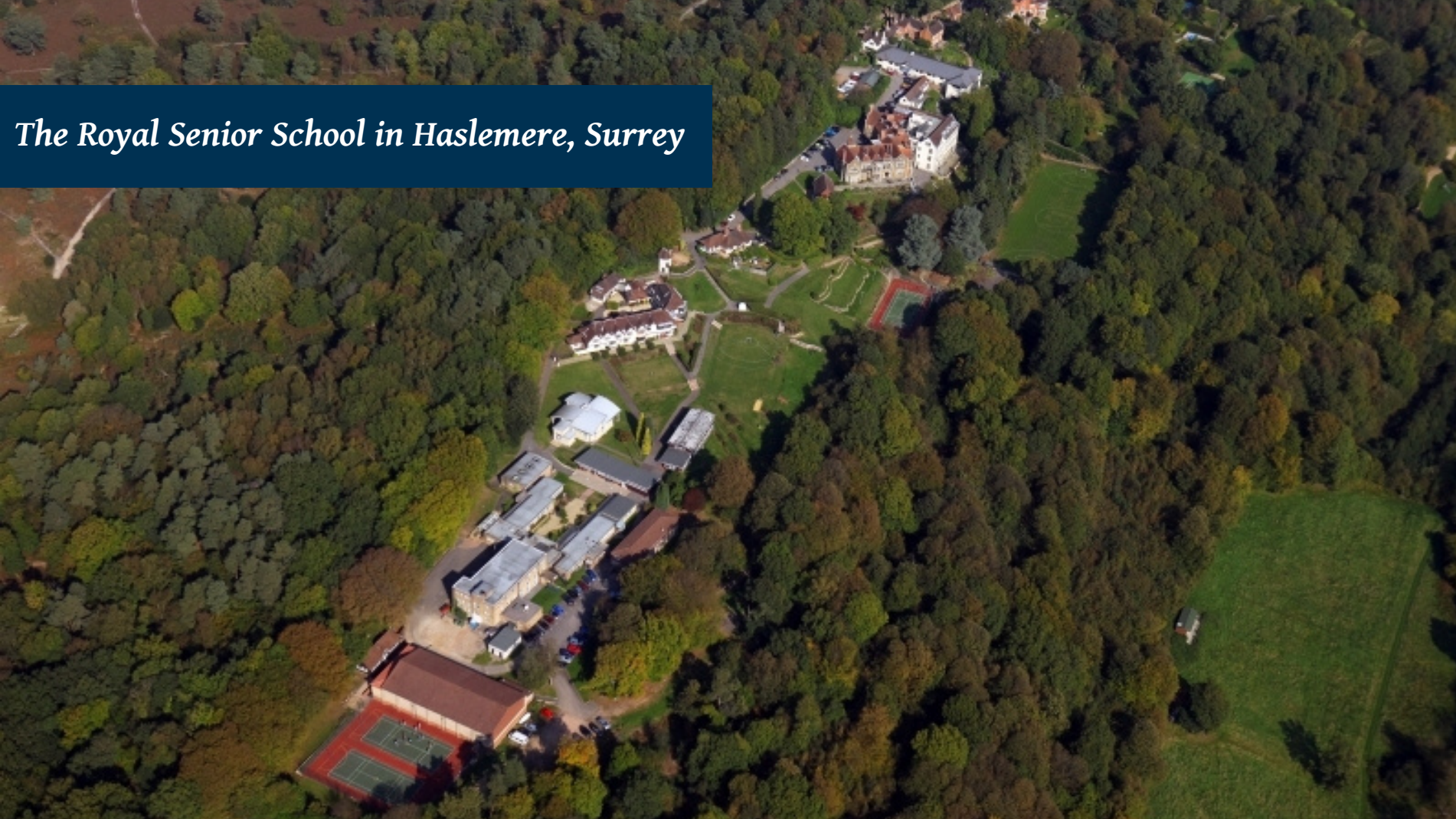
The Royal Senior School in Haslemere, Surrey