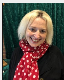
Ruth Green Primary School Improvement