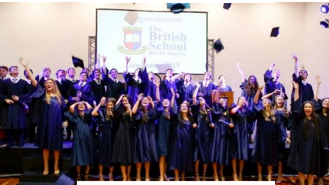
Barra Site Graduates