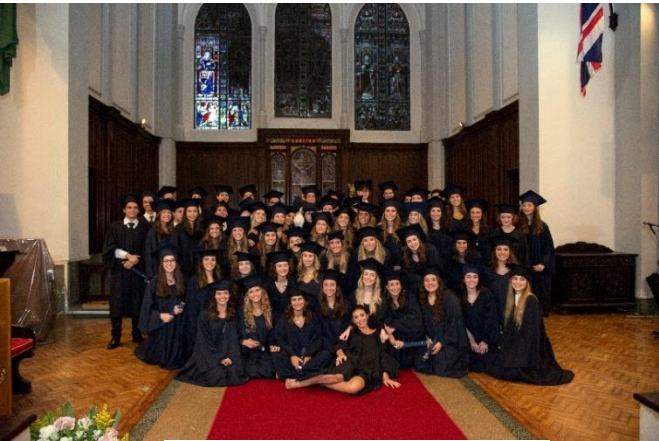
Urca Site Graduates

In addition to being an IB World School, The British School has been accredited by the Council of International Schools (CIS) since 1999 and is visited by teams from CIS every 5 years in order to assess the quality of operations and programmes across all sites. The British School was most recently fully re-accredited in January 2018 by a large team of CIS Evaluators, where the school met or exceeded all 57 standards, with no conditions set. The school is in the process of COBIS membership.