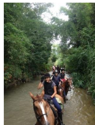
The Duke of Edinburgh’s International Award