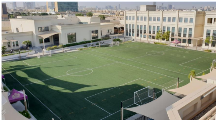
swimming pool, cricket pitches, tennis and netball courts and numerous indoor and outdoor multi-purpose areas.

The sporting facilities include both a learner and a 25 metre