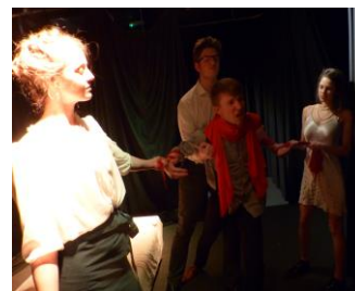
Punch Drunk Inspired of the Seagull by Anton Chekhov