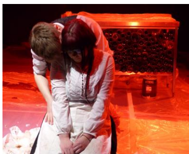
Artaud Inspired Reinterpretation of Reinterpretation. Playboy of the Western World by John Synge