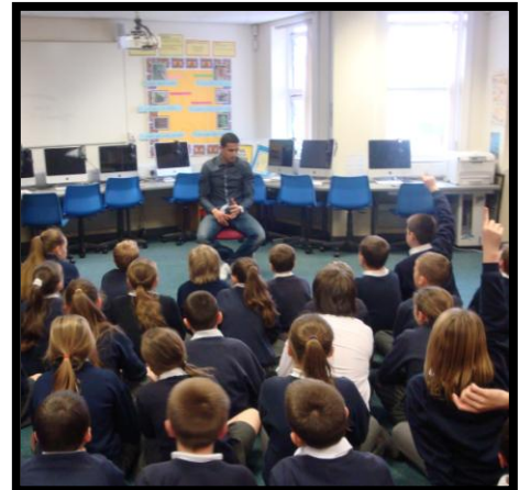
Former Everton Footballer Tim Cahill visits Barlows