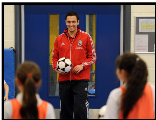
Footballer Stewart Downing Visited Barlows