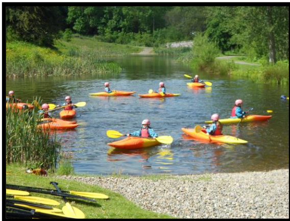
Years 5 and 6 Residential at Kingswood Colomendy