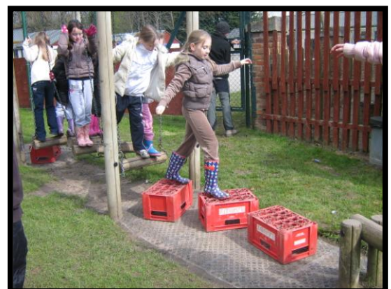
Years 3 & 4 Residential at Barnstondale Centre