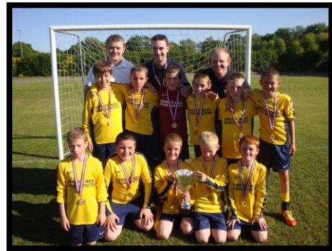
Boys' Football Team Football Kit kindly donated by Ashley Neal Driving Instruction