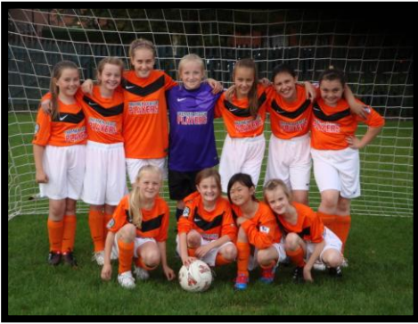
Girls' Football Team

The school offers children many opportunities to try out their sporting prowess in such sports as football, cricket, athletics, basketball, netball and gymnastics. Here are some photos of some of the school teams.