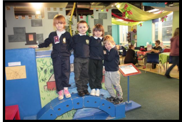
Trip to Underwater Street