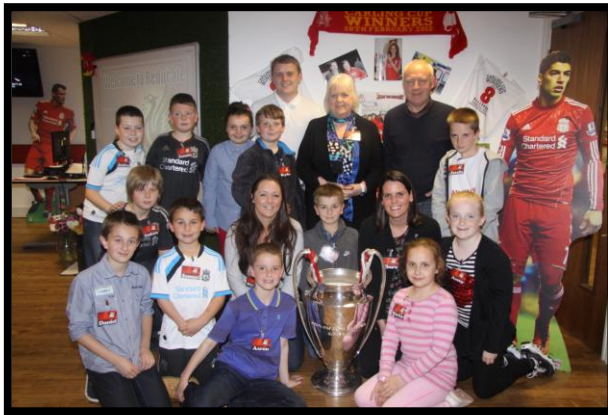
Tactics 4 Families Night at LFC Reducate

During the school year, each year group will have the opportunity to attend many educational visits; including a residential trip to Colomendy or trips and excursions to such venues as Keswick, York, exhibitions and the local supermarkets. We have also participated in an inter-schools quiz and visits from guest speakers.