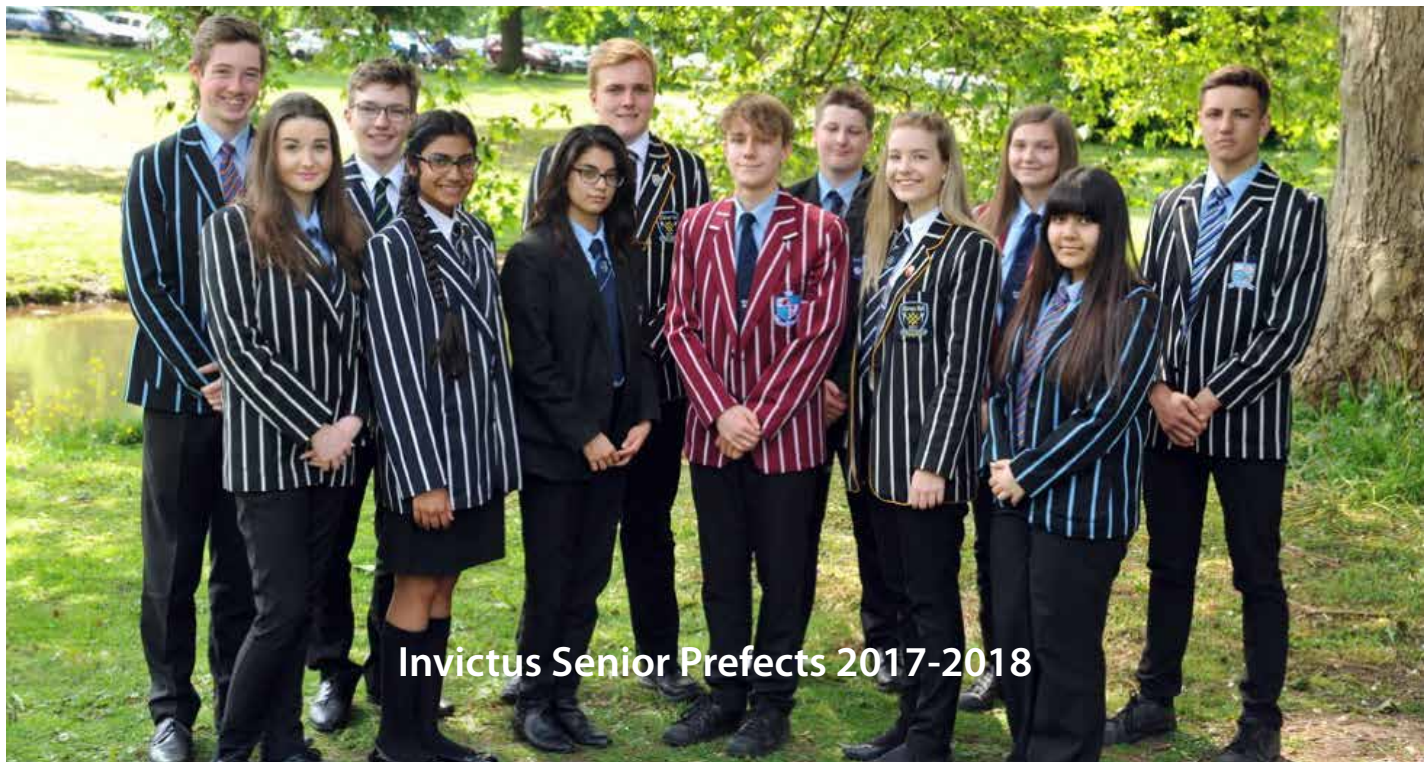
Invictus Senior Prefects 2017-2018