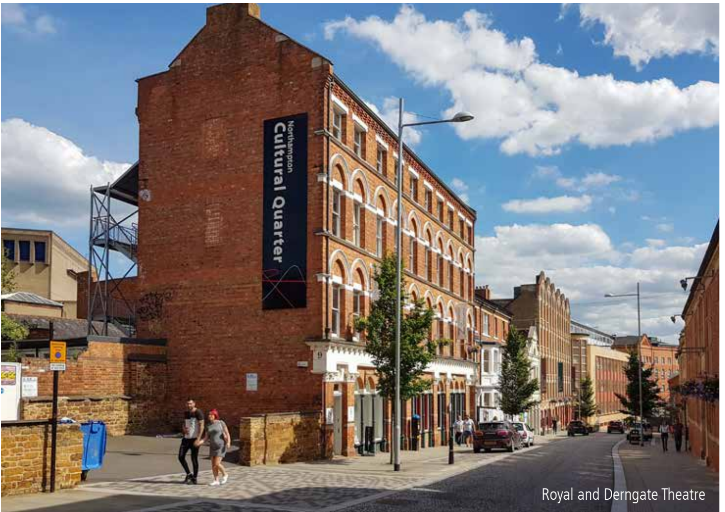
Royal and Derngate Theatre