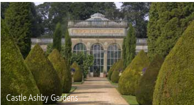
Castle Ashby Gardens