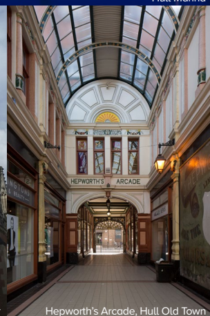
Hepworth's Arcade, Hull Old Town Hull Maritime Museum