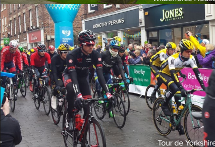
Tour de Yorkshire