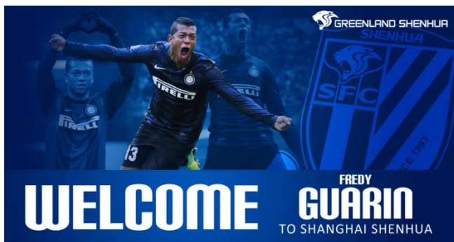
A Shanghai Shenhua Poster in 2016

Shanghai is the hometown of many outstanding and well-known Chinese professional athletes, such as Yao Ming, the 110-meter hurdler Liu Xiang, the table-tennis player Wang Liqin and the former world women's single champion and current Olympic silver medalist badminton player Wang Yihan.