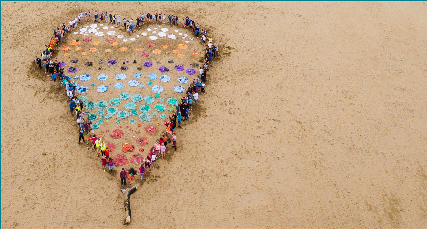
The Budehaven Heart - Summerleaze Beach