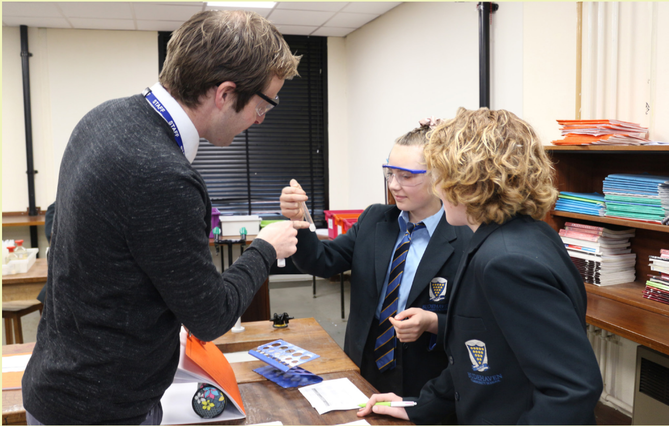
Year 8 Science