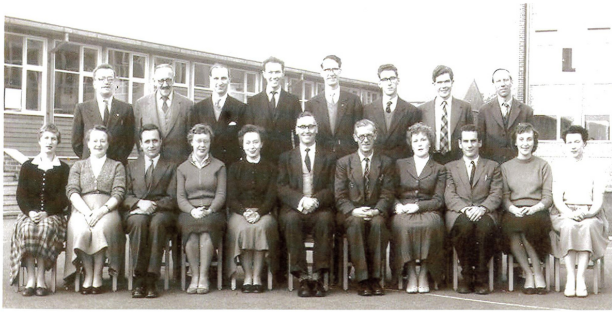
Staff photo, 1958.