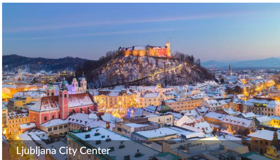
Ljubljana City Center