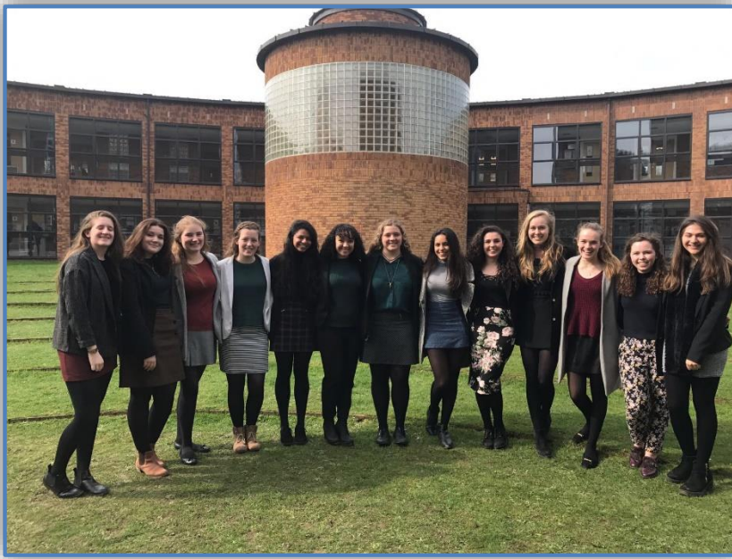
The Head Girl Team provides an important role in key decision-making within school

'The sixth form is outstanding. Students make outstanding progress gaining very strong examination results because the well-planned curriculum meets their needs so well. Teaching is outstanding and demanding, as are leadership and management. Students thrive in the challenging, but highly supportive, environment.' Ofsted May 2012