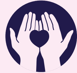
Givers, Not Takers